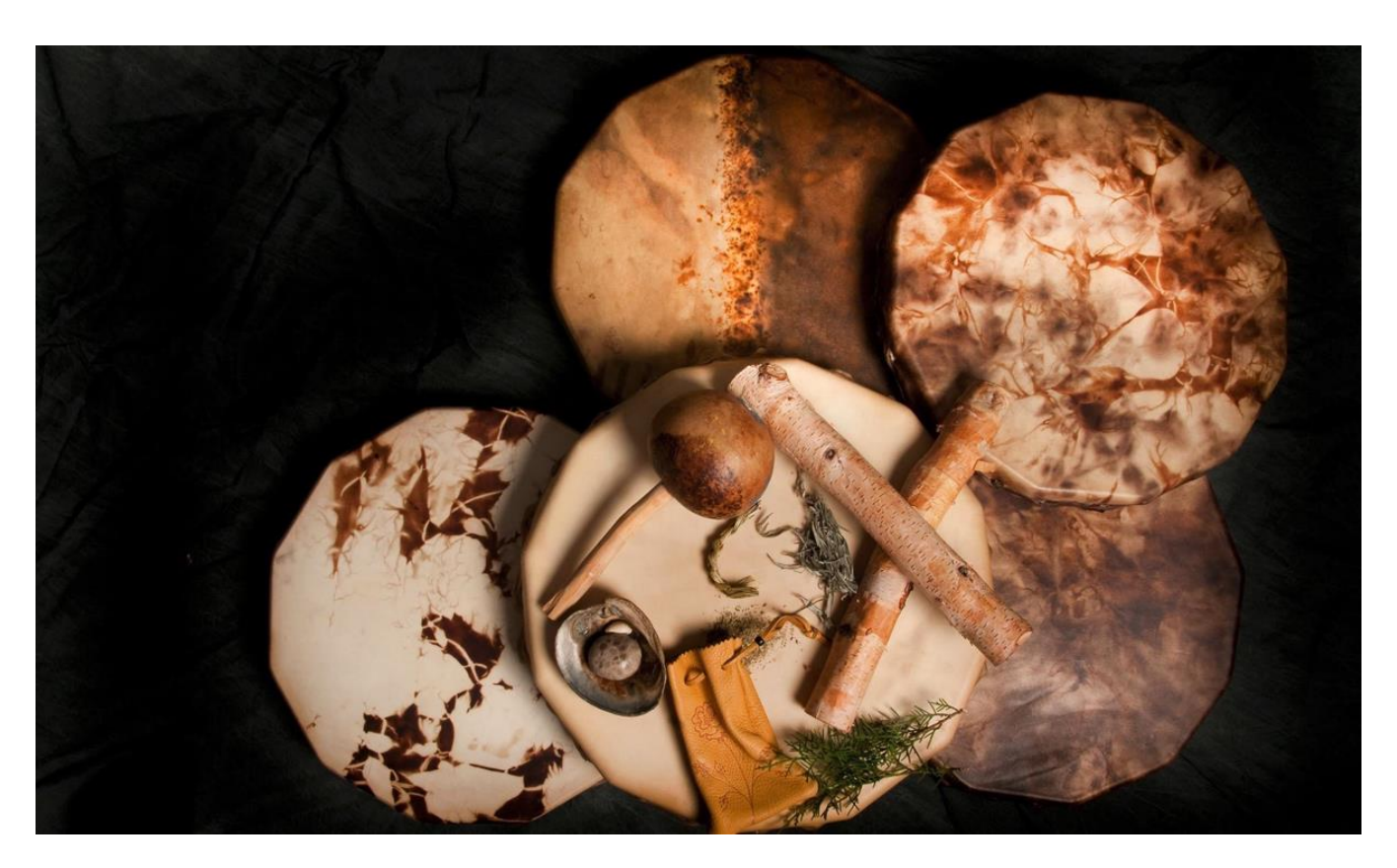
The Ghost Supper By Carole Underwood

In American Indian villages Ghost Suppers are held on November 2nd, All Soul's day, to honor deceased loved ones, invite them to return to share food with the living, and gather families together for community remembrance meals.